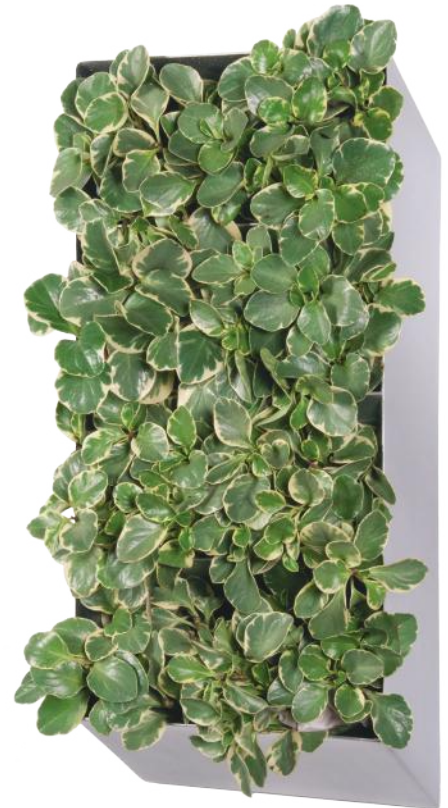
Available in 42 finishes

Simply add 3-4 wicked plants to each shelf and fill each shelf with water. Watering cycle is normally 1-2 weeks.