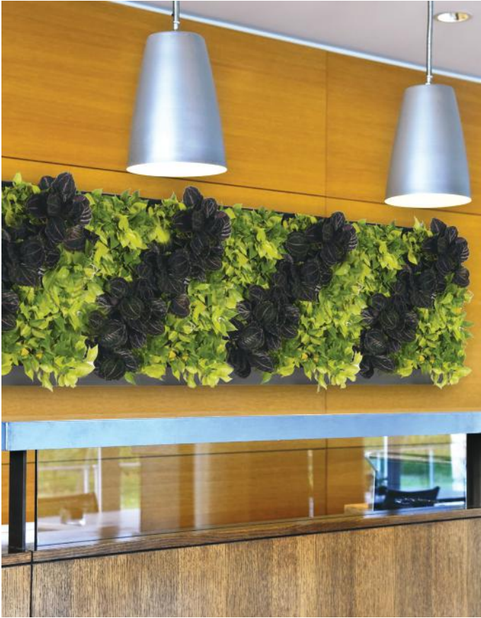
Four PP-3232's arranged horizontally