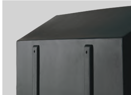
Rails on back allow for air circulation