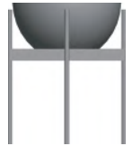
EBL-1808 Earth Bowl