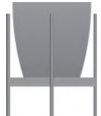
PHSQ-1717 Phoenix Square