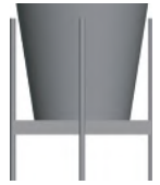
TC-1816 Tapered Cylinder