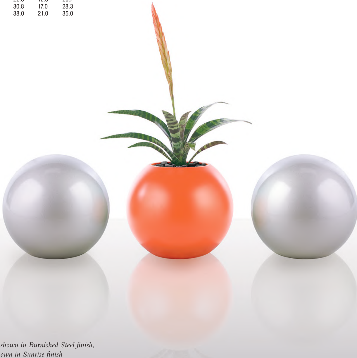
Sculpture shown in Burnished Steel finish, Planter shown in Sunrise finish