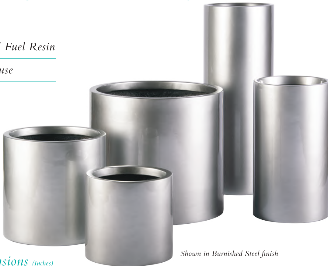
Shown in Burnished Steel finish