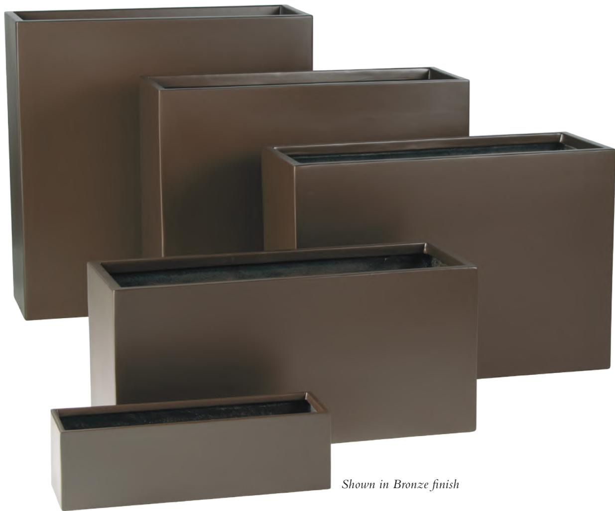
Shown in Bronze finish