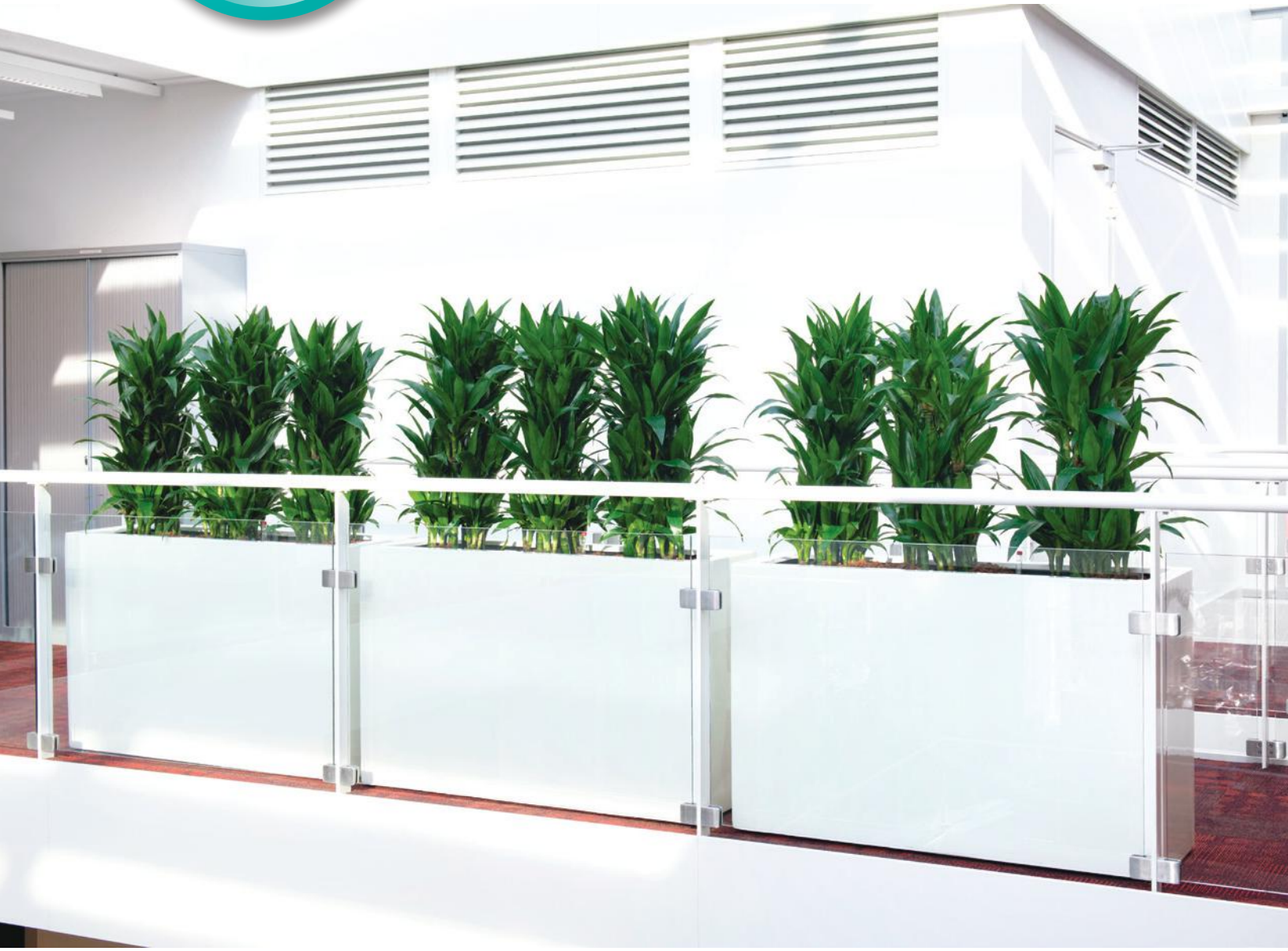
Earth Walls shown in Gloss White finish