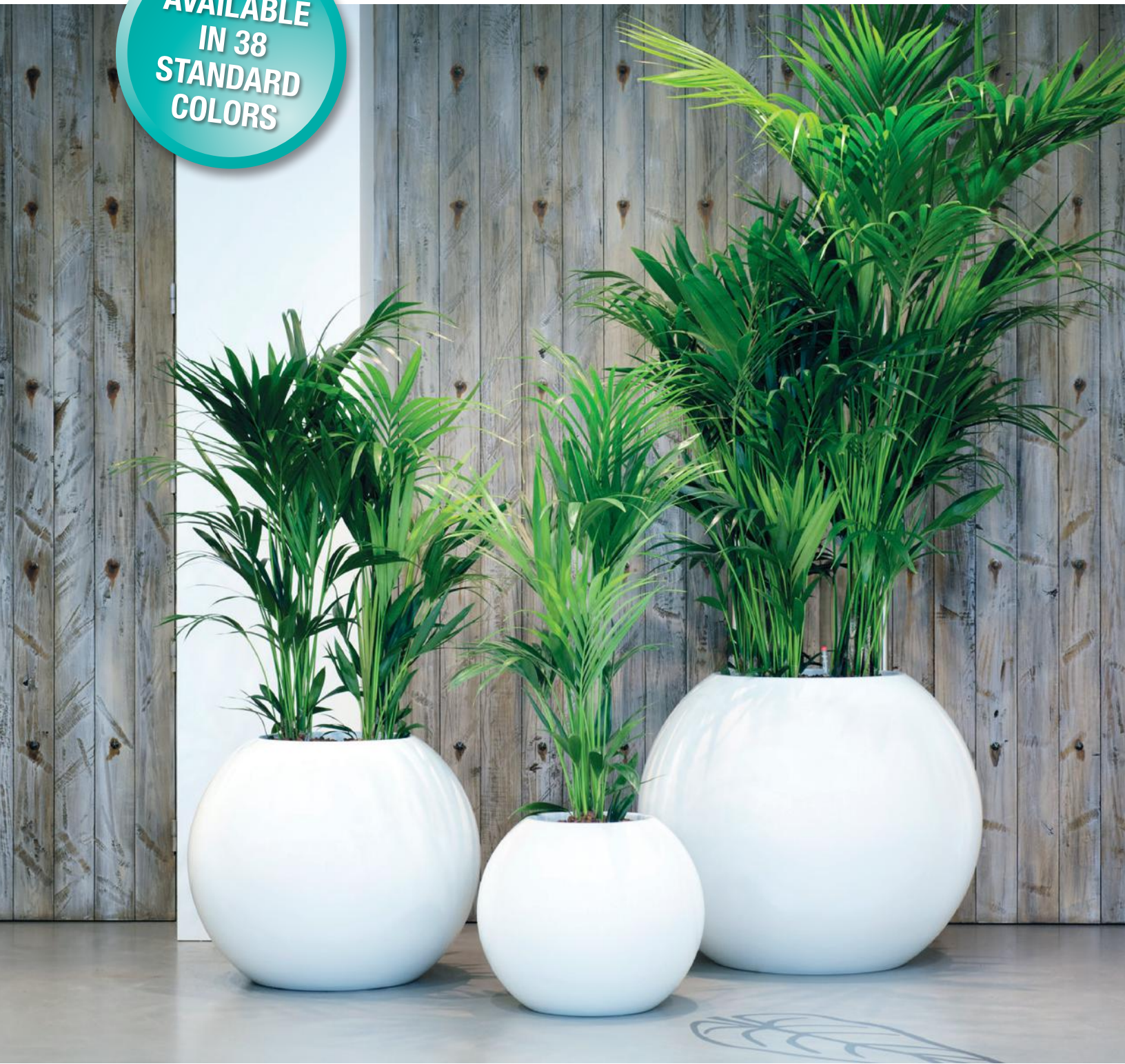
Earth Spheres shown in Gloss White finish