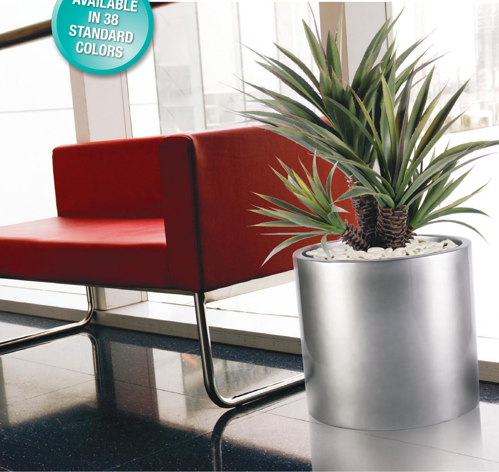
Earth Cylinder shown in Burnished Steel finish