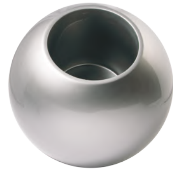
Built-In Planter for Easy Installing