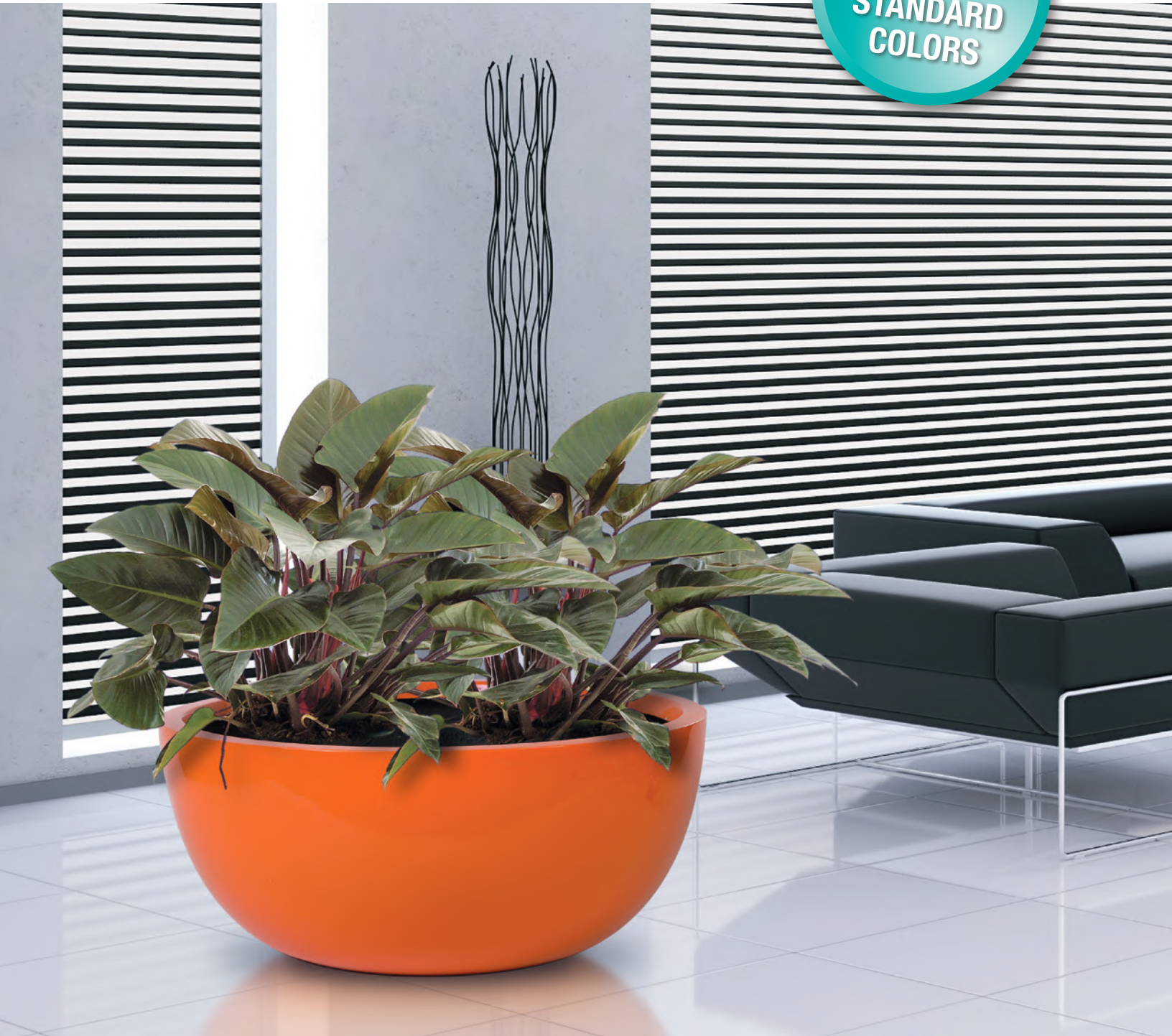
Earth Bowl shown in Orange finish