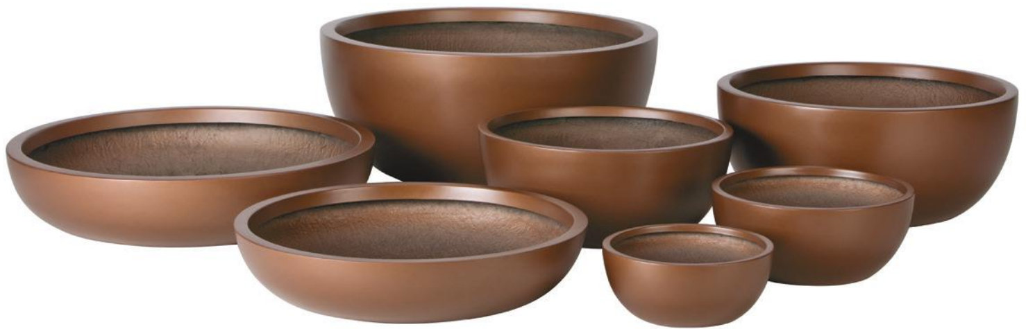
Shown in Burnt Copper finish