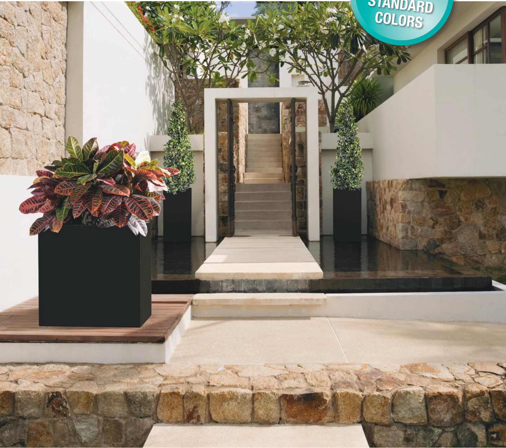
Earth Cube and Tall Squares shown in Espresso finish