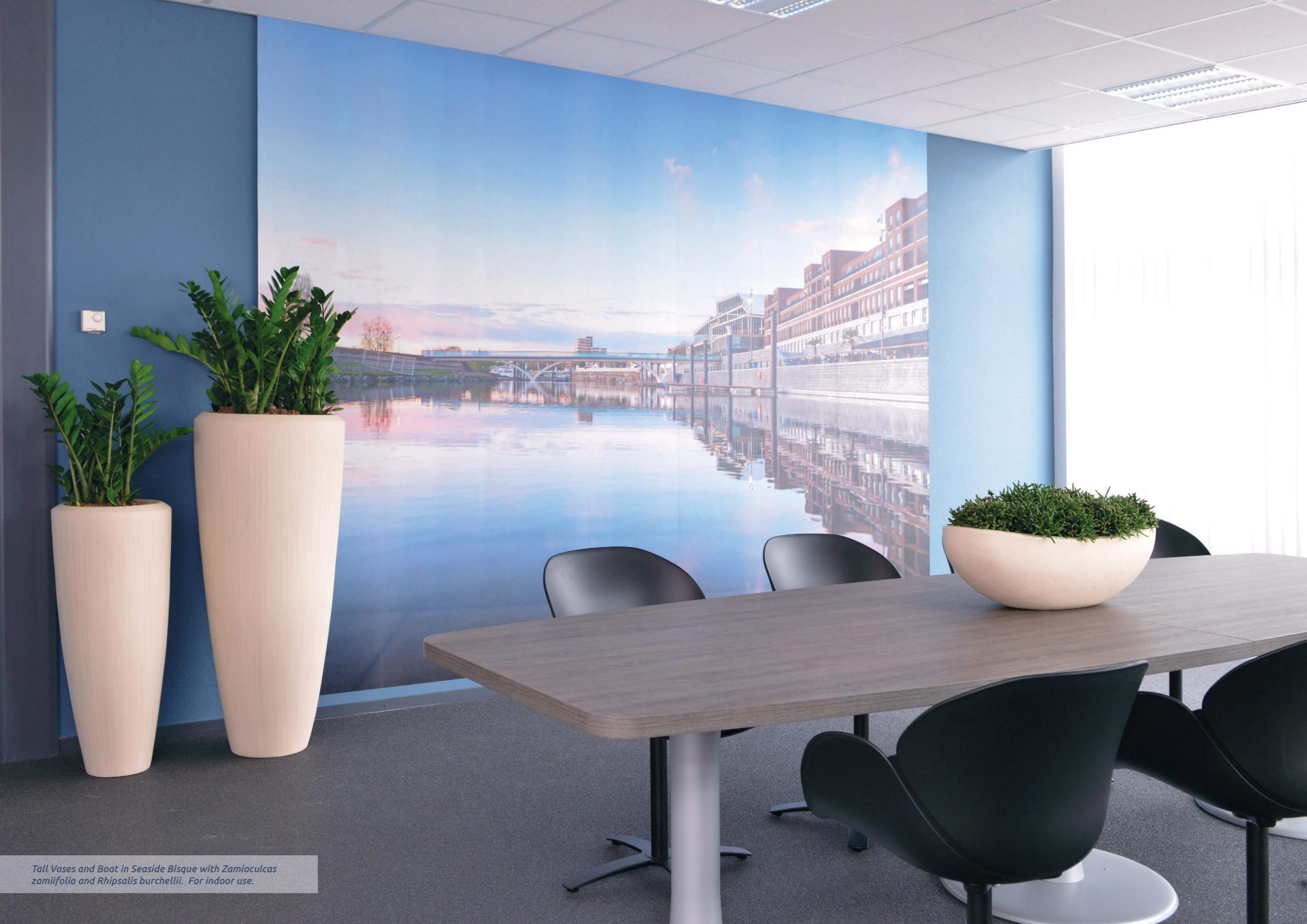
Tall Vases and Boat in Seaside Bisque with Zamio culcas zamiifolia and Rhipsalis burchellii. For indoor use.