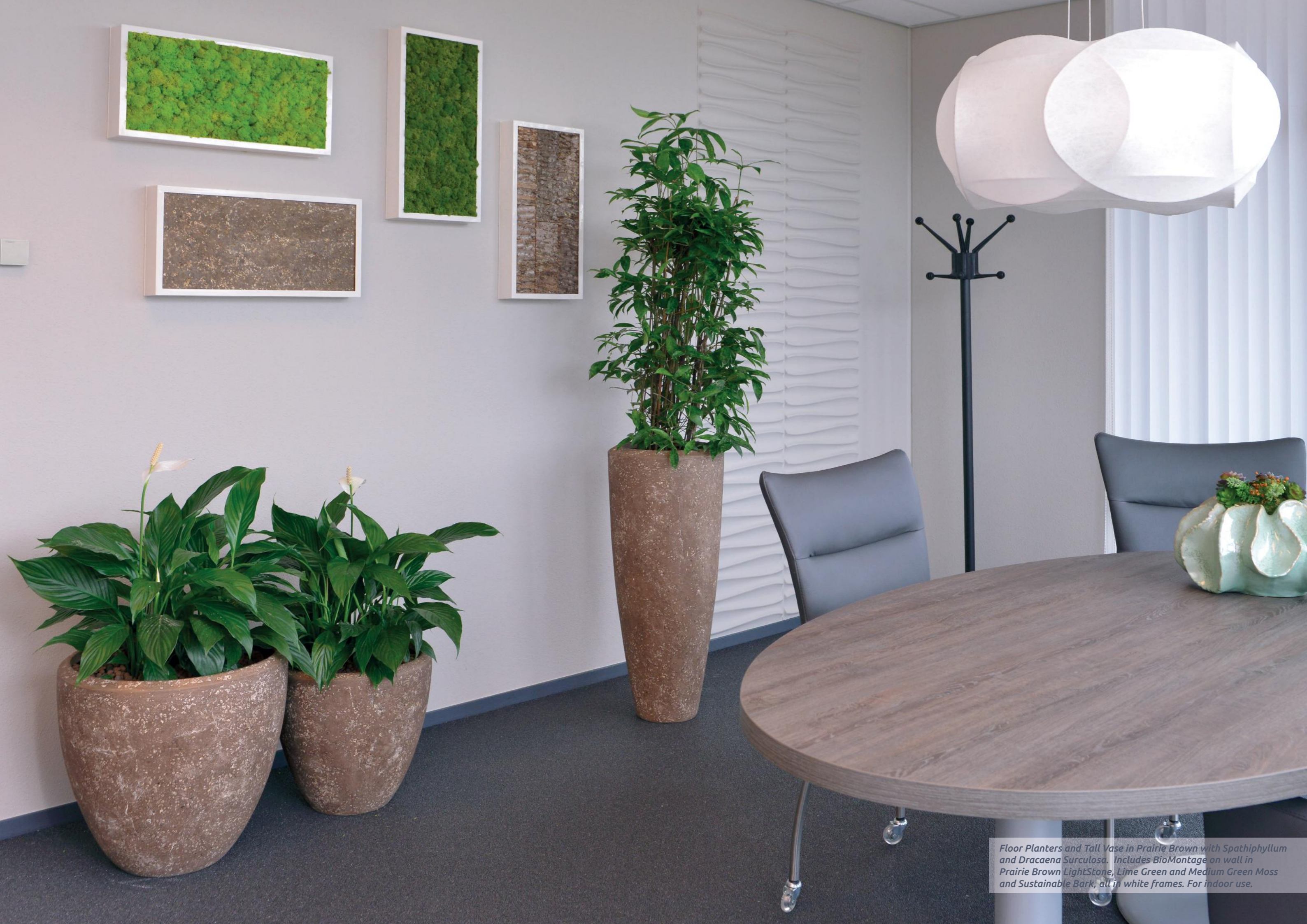
Floor Planters and Tall Vase in Prairie Brown with Spathiphyllum and Dracaena Surculosa. Includes BioMontage on wall in Prairie Brown LightStone, Lime Green and Medium Green Moss and Sustainable Bark, all in white frames. For indoor use.