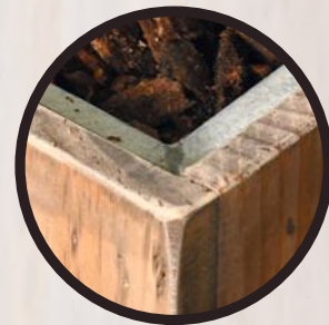
Liners made from galvanized steel