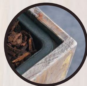
Liners made from recycled plastic